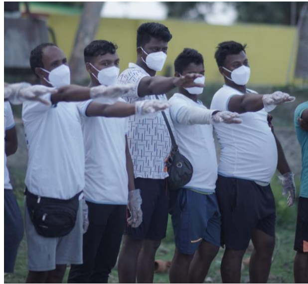
Mission LiFE: Empowering Youth for Environmental Action and Global Impact