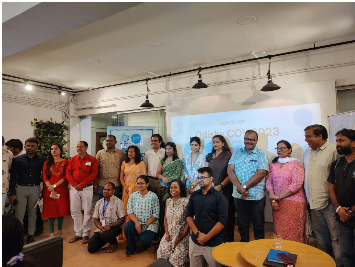
Youth Empowerment for Sustainable Change: Odisha Conference of Youth (OCOY) Launched on World Environment Day 2023