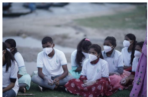
Joining Hands for a Cleaner Coastline: Youth4Water Plus Beach Cleaning Drive on World Environment Day 2023