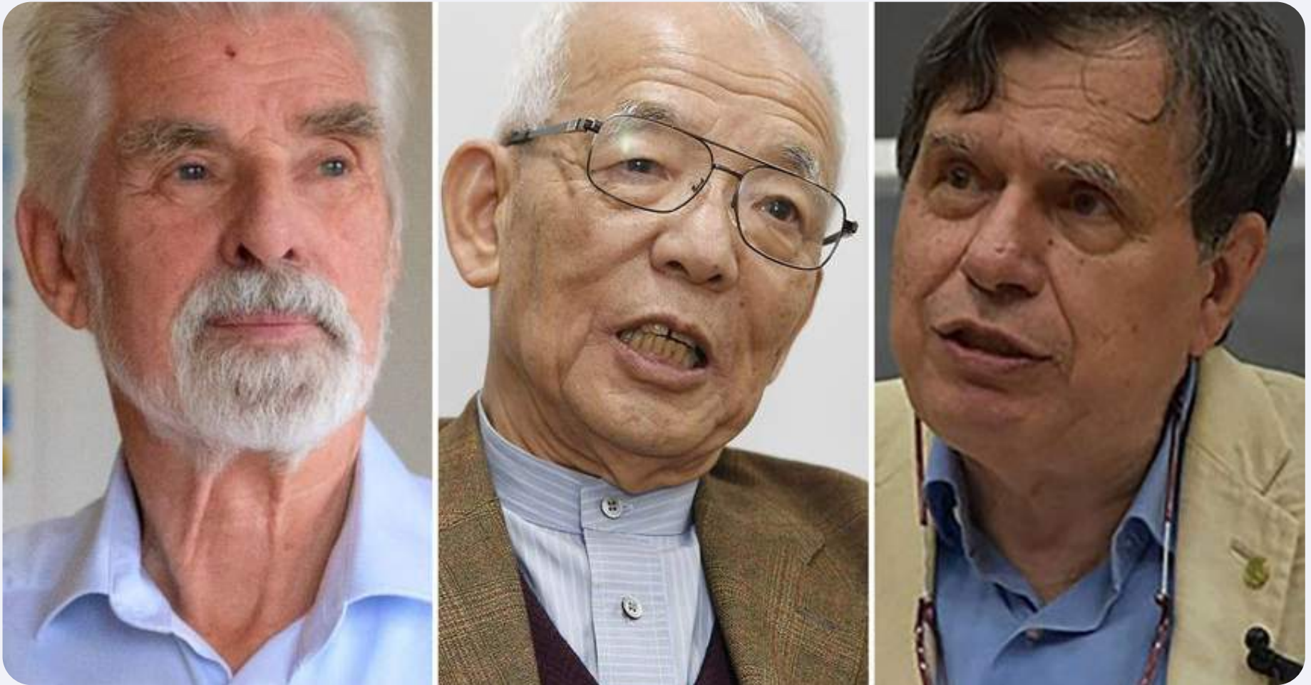
Klaus Hasselmann, Syukuro Manabe, and Giorgio Parisi