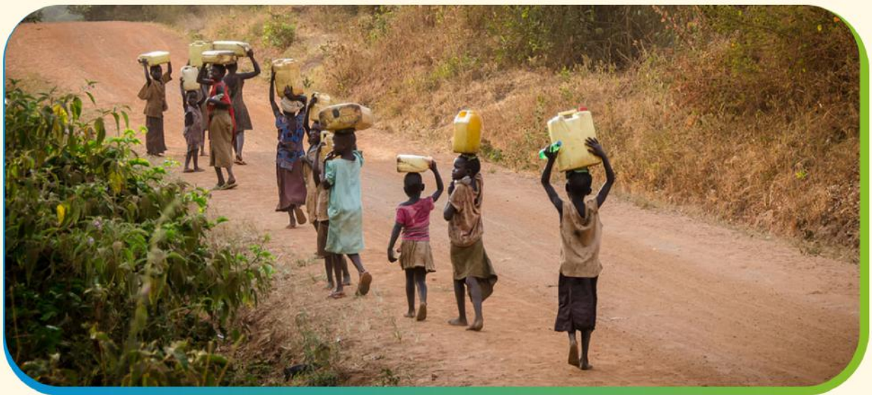
Children of Sierra Leone walk miles for water, Pic Credit: CEOworld

Many countries are currently facing a water crisis but I'm highly interested in the problem of Sierra Leone , a country of the Africa Continent. Major water, sanitation and hygiene challenges in Sierra Leone are the low levels of use of basic sanitation services, access to safe/quality drinking water and inadequate use of safe hygiene practices by children and their families. The determination of these priority concerns is based on the available evidence derived from the analysis of the national WASH situation.