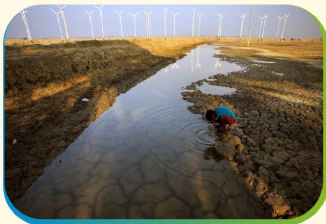
A boy is drinking water from a dried up River in Bangladesh, Pic Credit: Riasat Rakin/Flickr

Climate change-induced natural disasters plague Bangladesh due to its geographic location and flat, low-lying topography. High population density, poverty and reliance on climate-sensitive sectors for water and food security, particularly water resources, agriculture, fisheries and livestock, increasing its vulnerability to climate change.