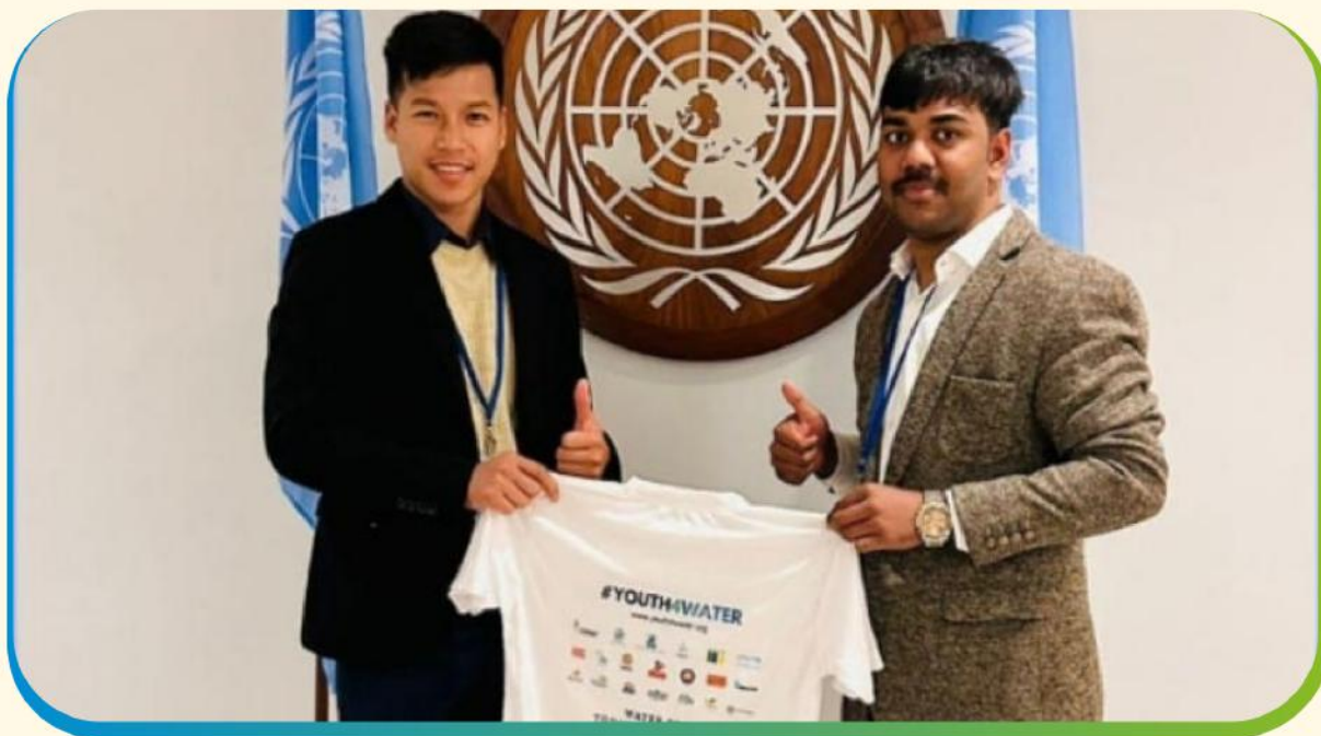
Representing Youth4Water Plus at the Conference

I participated in the United Nations General Assembly, many youth constituency events, UNICEF led events and some events organized by the Bangladesh, Netherland and Tajikistan water ministry..